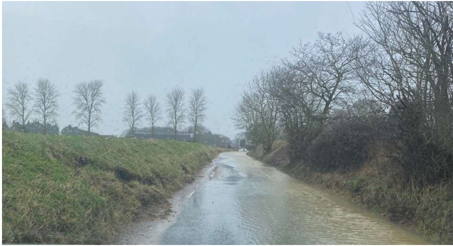
Figure 1. A photo of the B1051 taken in February 2024. Showing typical flooding, and associated damage to carriageway and banks adjacent to site Elsenham A76.