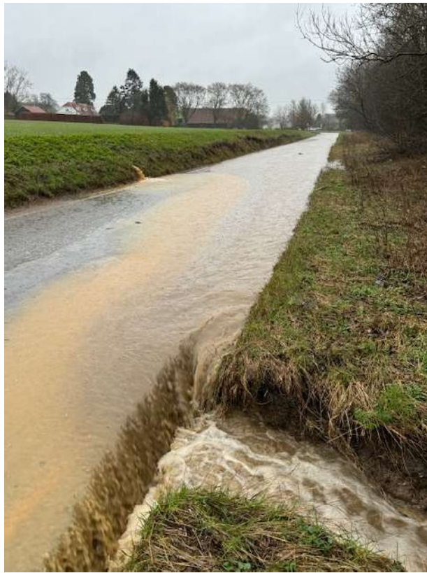
Figure 2. Two photos taken of the B1051 in February 2024. Showing typical flooding, with associated erosion adjacent to site Elsenham A76.