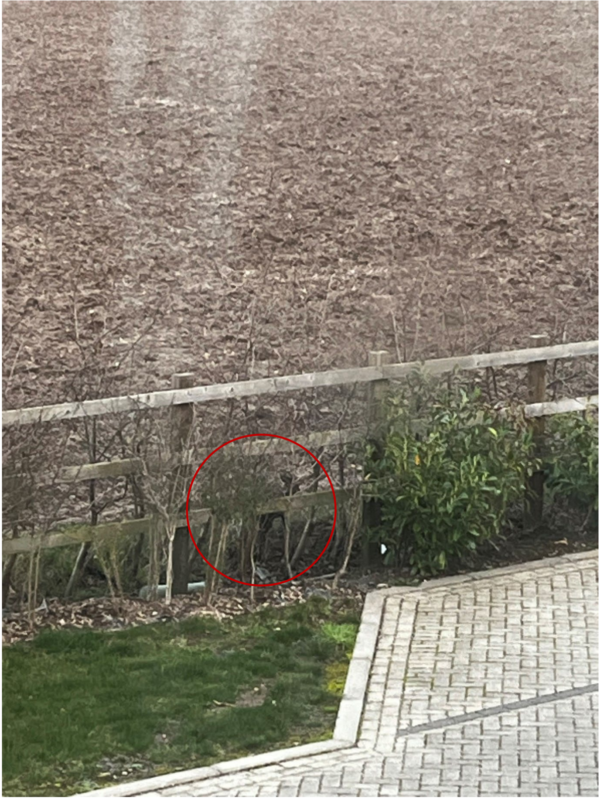
Photograph of muntjac deer taken from [redacted] Newman Fields, 24 February 2024