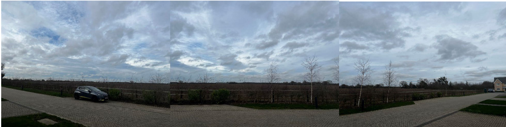
Panorama of the proposed site from the perspective of the houses in Newman Fields