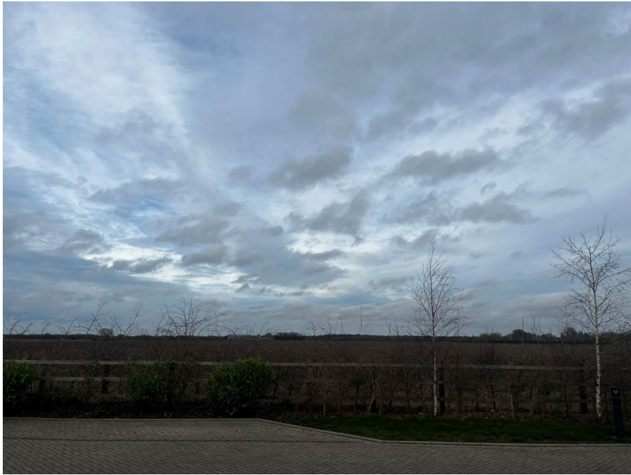
View from Newman Fields