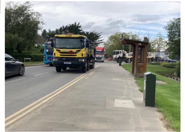
Access onto Parsonage Road for Proposed 96 Homes