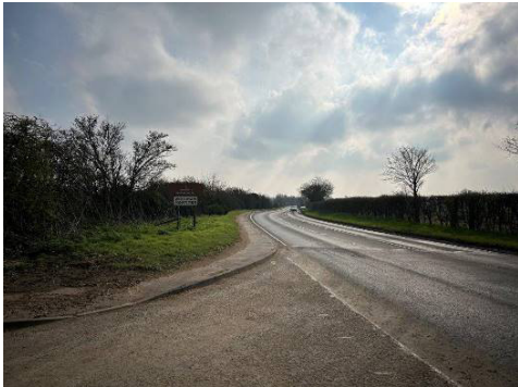
Plate 1: Visibility to the left at site access