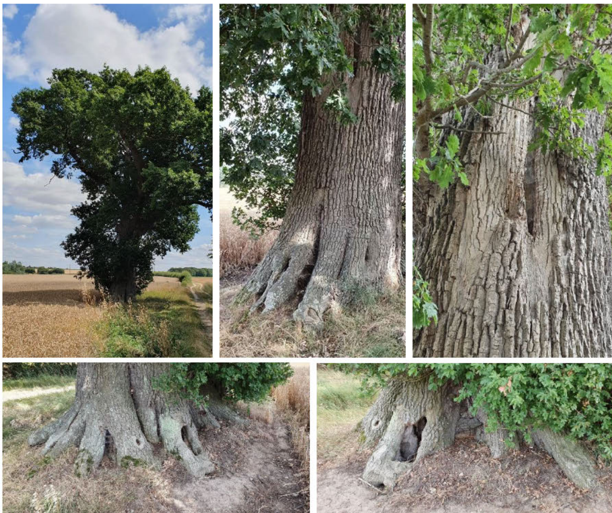
Figure A48-01: TPO Veteran Oak Tree

The TPO tree will be retained along with an existing tree lined hedgerow on the southern side of the Essex Way. Root Protection Areas and/or an appropriate buffer of at least 15m would be established to prevent damage to the TPO tree (similar to those previously applied by the Site-specific issues to be addressed within the existing Minerals Local Plan for the protection of Storeys Wood for Site A5 and Site A6).